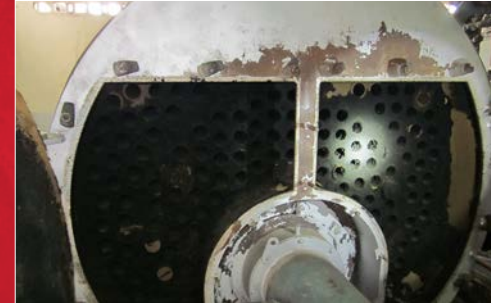
BOILER PRIOR TO RECONDITIONING

QUALITY CONTROL - ASME and National Board Codes, insurance requirements, not to mention overall safety and reliability are main directives on all projects executed by CCC.