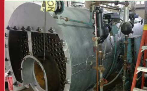
BOILER AFTER RECONDITIONING PERFORMED BY CCC