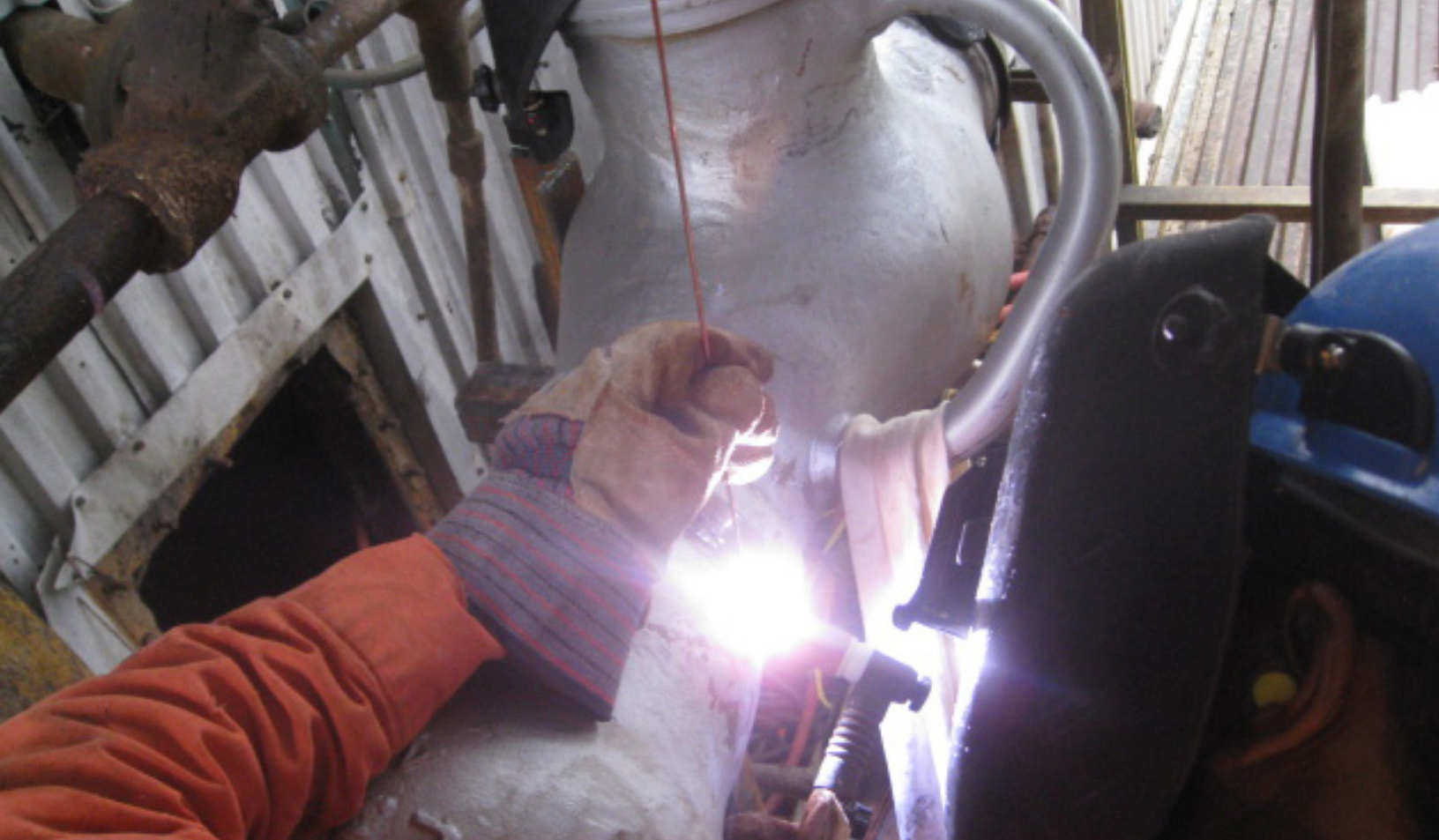
REPLACING AN 850 PSI STEAM VALVE