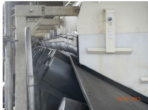
New Parallel Conveyors Replacing Troublesome Crossover Conveyors in Coal Transfer House