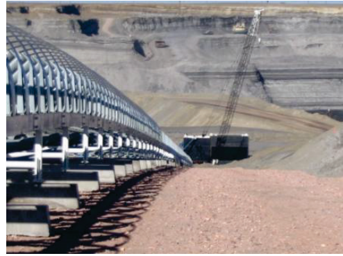
Coal Mine Truck Dump & Conveyor System Install