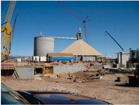
Turnkey Installation of Grassroots Cement Plant