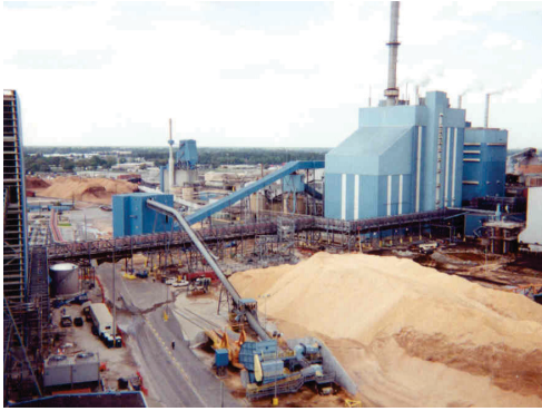
Wood Chip Conveyor Installation